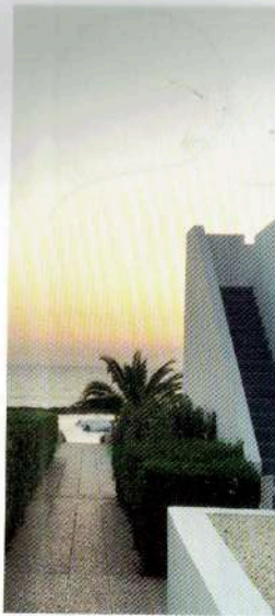
The rooms at the Almyra have sea views, while state-of-the-art infinity pools are there to be enjoyed. Luxurious relaxing at its best