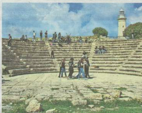
STEPPING OUT: The Odeon in the archaeological park is now used as a theatre