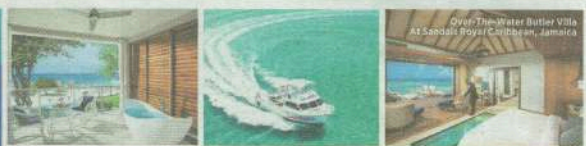
Over The Water Butler Villa at Sandals Royal Caribbean, Jamaica

5-Star Global Gourmet™ dining at up to 16 Restaurants • Unlimited Pours of Premium Spirits • Unlimited Land and Water Sports • The Caribbean's Most Comprehensive Scuba Diving Programme with Unlimited Dives and Equipment for Certified Divers • Unlimited Rounds of Golf in Jamaica and St. Lucia • 6 Varietals of Robert Mondavi Twin Oaks wines • Tips, Taxes & Transfers included • Butler Service in Top-Tier Suites • The Caribbean's Best Beaches