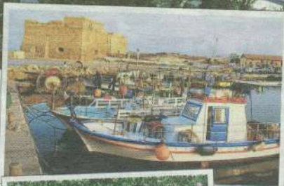
MATT FINISH: Stunning sea views from the Almyra Hotel, top. Paphos Castle and harbour, above. Matt chills out, left, and one of the modern pools at the Almyra Hotel