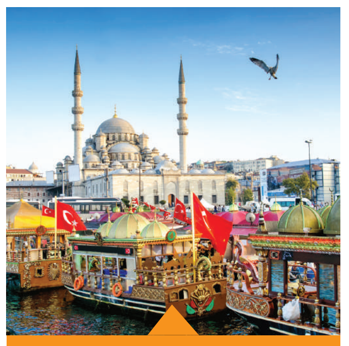
TURKEY OPENS UP... The Turkish Ministry of Foreign Affairs has announced its decision to grant tourist visa exemptions to UK citizens. Additionally, citizens of Austria, Belgium, the Netherlands, Spain and Poland will be able to visit Turkey without a tourist visa. The exemption applies to touristic travels to Turkey for every 90 days within a 180-day period. This comes into force on March 2.